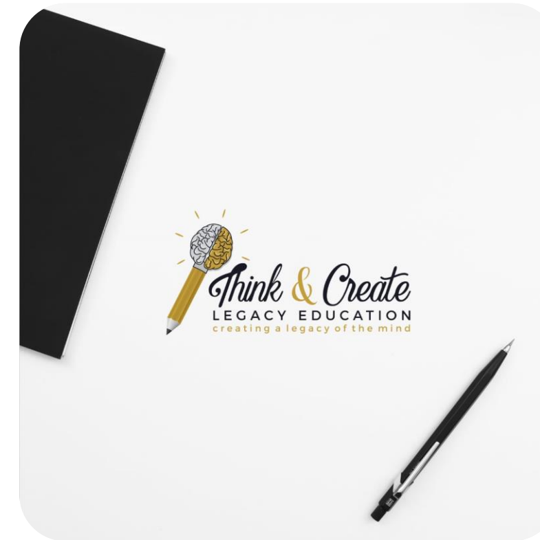
STORYTELLING & LITERACY PROJECT