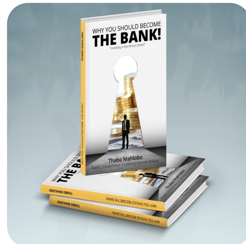
THE WEALTH LEGACY SCHOOLS CHALLENGE