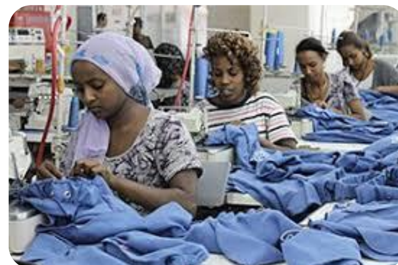
BUSINESS GROWTH HUBS