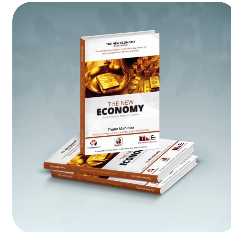
THE NEW ECONOMY TOUR